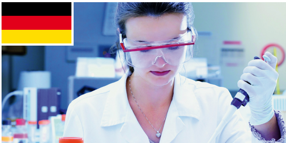
We source, supply and distribute a wide range of innovative pharmaceutical ingredients