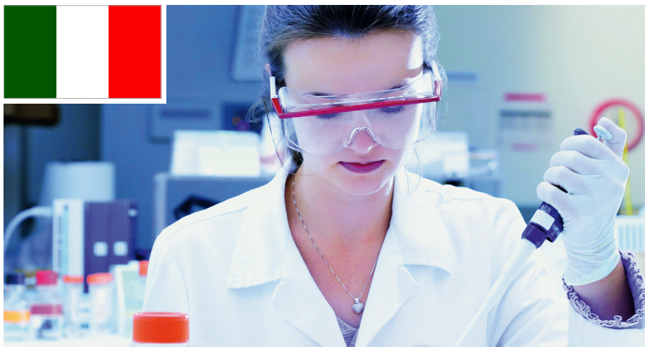
We source, supply and distribute a wide range of innovative pharmaceutical ingredients