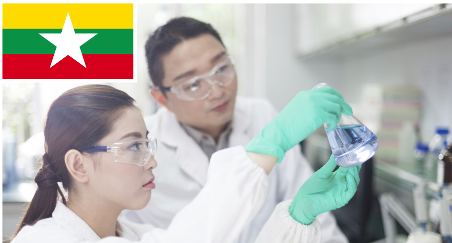
We source, supply and distribute a wide range of innovative pharmaceutical ingredients