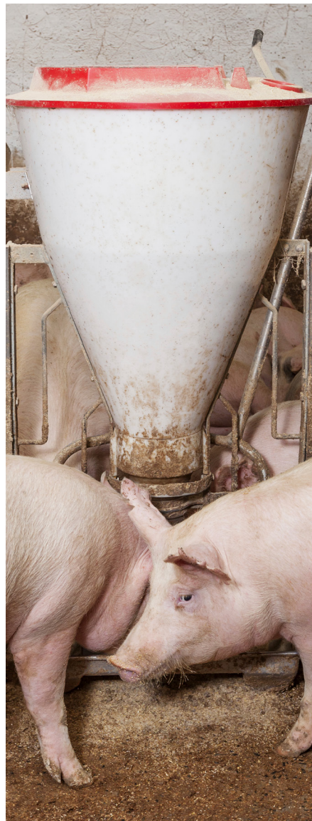
A broad portfolio of animal care ingredients