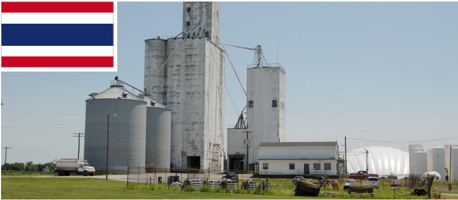
A typical grain silo