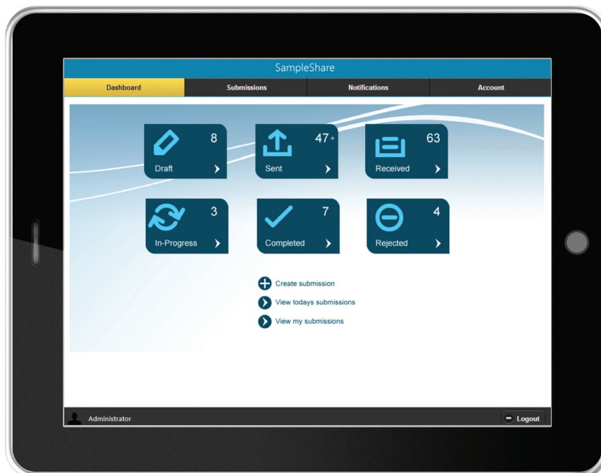
NuGenesis SampleShare dashboard for monitoring progress of current samples and reviewing completed sample submissions.