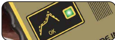
Patented “OK Button”

Easy to interpret by production process operators.