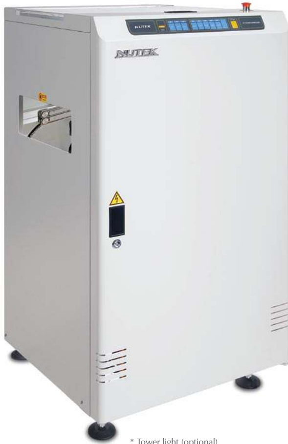
* Tower light (optional)