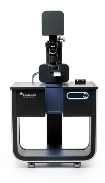
Flip the camera to suit your specific research conditions.