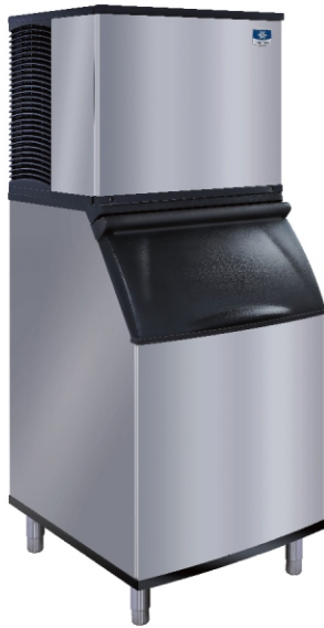
M1000 Ice Machine on A570V Bin

Model: MD1000A-251B MD1000W-251B MD1000N-251B MY1000A-251B MY1000W-251B MY1000N-251B