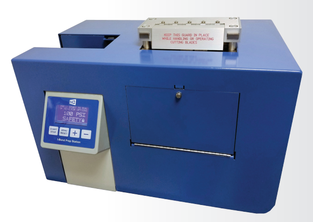
80-30 Ibond Prep Station

The Internal Bond™ Tester is designed to determine the internal bond strength of a variety of Paper and Board materials according to TAPPI T 569 and ISO 16260. The instrument design is based on a falling pendulum which creates a high speed impact on a paper specimen. The paper specimen is sandwiched between two double-coated tape substrates. The pendulum impact measures the total energy required to delaminate the internal fibers of a specimen in a "Z" type direction into two plies.