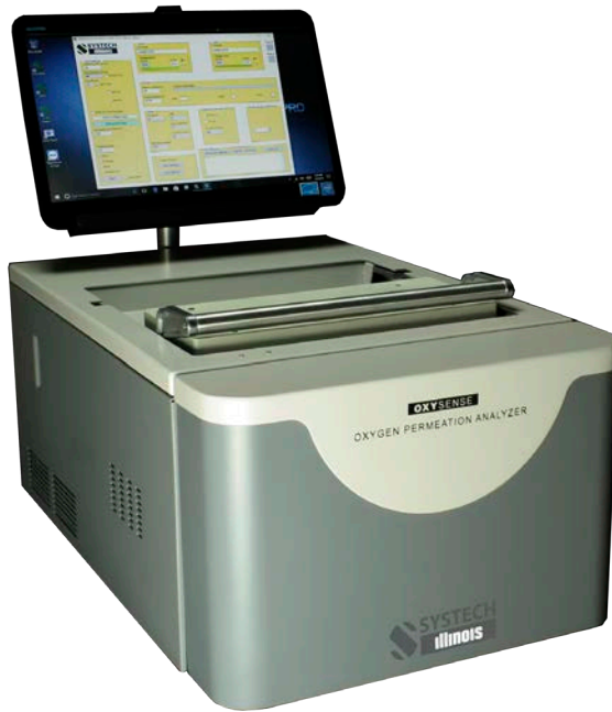
Shown with optional computer

Latest coulometric sensor technology ASTM D3985 compliant