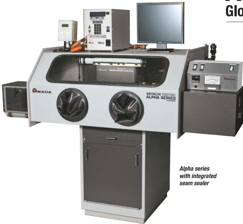
Alpha series with integrated seam sealer

The field proven Alpha Series glovebox systems provide compact and effective platforms for environmental control with excellent price to performance value. The Alpha Series is excellent for both production R&D applications. The glovebox is available in two sizes: one for projection welding applications and the other for seam sealing or general industrial use. Straight-forward controls allow the operator to easily operate oven, vacuum and inert gas backfill controls.