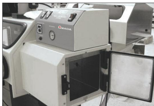
Alpha series optional vacuum bakeout oven