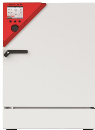
▲ CO 2 incubator CB 160