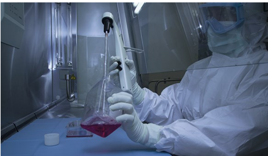
▲ Utmost safety is essential while preparing stem cells