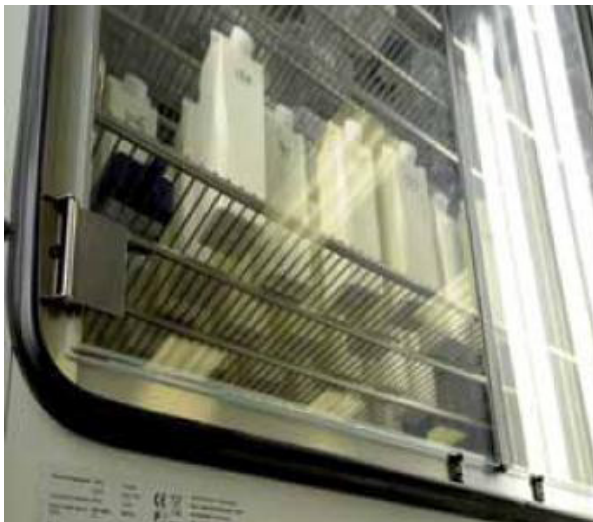
Figure 1: Constant climate chamber (Binder KBF 720) with door mounted lights used at Leatherhead Food Research for colour stability testing. 3

The shelf-life of a product is determined by storing the product under typical storage conditions that the product will experience, and measuring the changes occurring (chemical, microbiological and physical) over a specified time interval until the product becomes unacceptable to consumers. Food manufacturers are under constant pressure to launch new products in shorter time scales and often do not have sufficient time for real time shelf-life testing. Accelerated shelf-life testing (ASLT) is an indirect method of measuring and estimating the stability of a product by storing the product under controlled conditions that increase the rate of degradation occurring in the product under normal storage conditions. In addition to the prediction of product stability including colour, ASLT are useful for a number of other purposes, e.g. to determine product safety under abuse conditions, for troubleshooting in the initial stages of product development and for assessing packaging performance of a product. 3