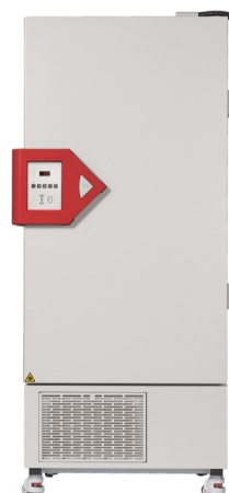
▲ Ultra low temperature freezer UF V 500