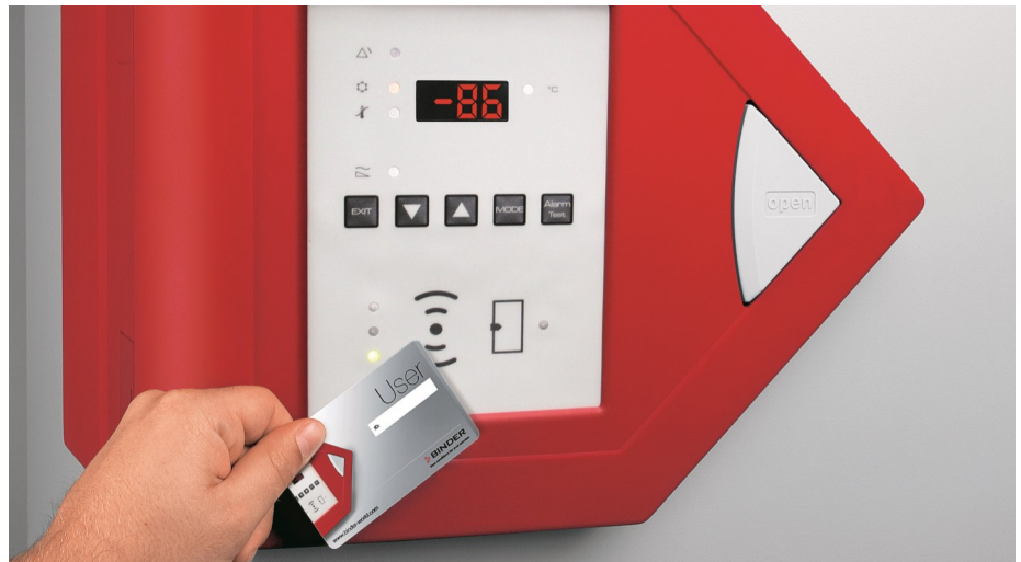
▲ Personalized access control via RFID

All pathological processes require samples to be able to be kept for extended periods of time. These samples often